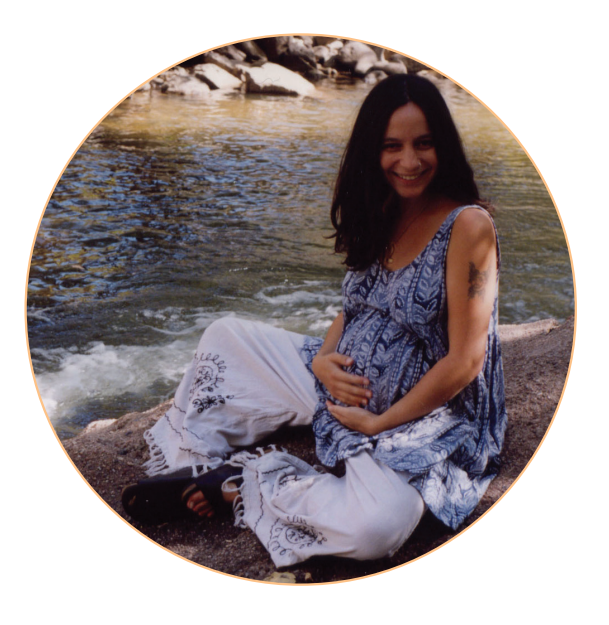
Singing Bowls and childbirth - a sensational combination!